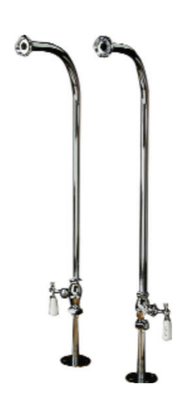
H: 30" (30-½" with nut)